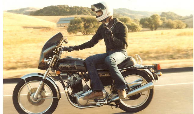
The Hogslayer and author, ca 1979

So why does this merit some time in our Field Notes? I'm not sure, but I guess sometimes I feel that life is just too 'convenient'. Why do we like to go camping or 'rough it' somewhere except to get back to simpler more elemental senses. Riding the Norton does not afford much protection from the cold/heat, wind and bugs, but pulling big positive/negative G's and leaning hard into corners of Highway 1 near Big Sur gets the juices going for an exhilarating time. Some of you do that with snow boarding or other means, but it is all good stuff with some risk.