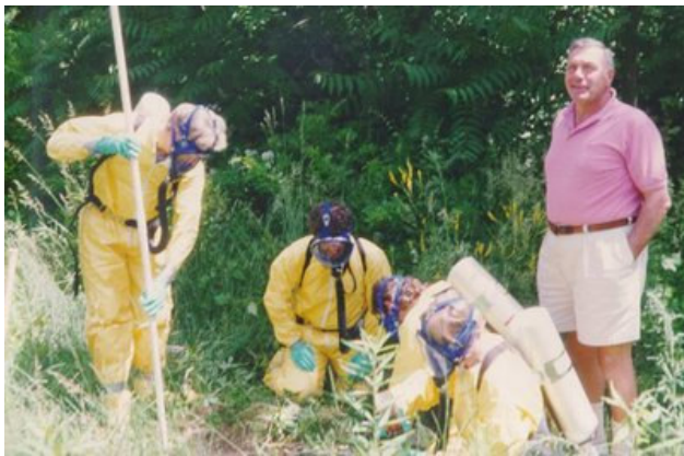
Check the MDSP sheets for appropriate wear while supervising Bio-Hazard Field Investigation. Or better yet stay away!